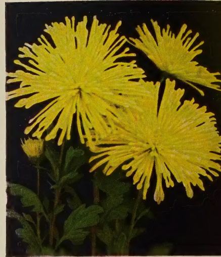
YELLOW SPOON. 60c each; 3 for $1.50